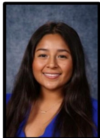
Perla Catalan Treble Choir